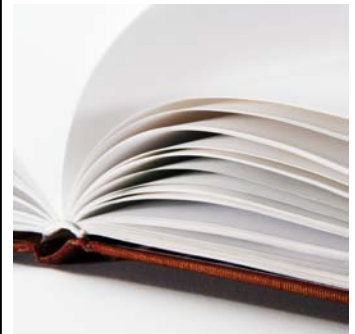
ONLY Chamber Members can advertise in this Directory!